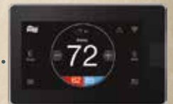
EcoNet Smart Thermostat